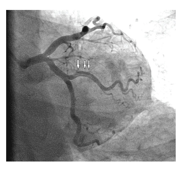
Figure 3. Coronary angiography revealed a linear filing defect with an overlying thrombus in the first obtuse marginal branch of the circumflex coronary artery (white arrows) suggestive of SCAD.

The 12-lead ECG was normal (Fig. 2) as were the serial ECGs. Troponin measured 3 h after the onset of pain was < 3 (0 - 14 ng/L), chest X-ray was normal and baseline blood tests were