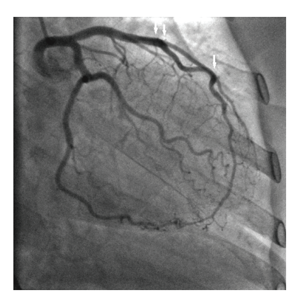
Figure 1. Coronary angiography showing mild atheroma in the LAD (white arrows).

monitoring. She was initially treated for a suspected ACS with a loading dose of aspirin, clopidogrel and fondaparinux, morphine analgesia and GTN spray. Unfortunately, the pain, which initially settled, recurred in a more severe manner and a decision was made to refer her for an urgent coronary angiogram.