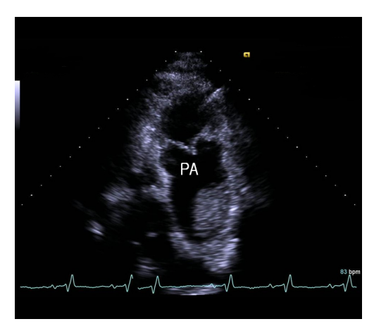
Figure 2. Transthoracic echocardiography at the modified parasternal short axis view showed proximal pulmonary artery thrombus. PA, pulmonary artery.

1), and a massive thromboembolus (4.35 \times 2.85 \text{ cm}) in the enlarged pulmonary artery (Fig. 2) with severe pulmonary hypertension (Fig. 3). Chest computed tomography (CT) revealed eccentric filling defect in the central and both main pulmonary arteries (Fig. 4). CT venogram showed diffuse thrombus from the suprarenal to the femoral vein. Therefore, CTEPH was diagnosed. The patient has been considered pulmonary thromboendarterectomy but he refused to undergo surgery and received anticoagulant therapy of heparin for 3 weeks. Then follow-up inferior vena cava venogram revealed that the thrombus had disappeared and the patient's symptom mild improved. He was discharged with warfarin and prostacyclin analogue therapy. 3 months later, follow-up TTE and chest CT showed there was no significant improvement.