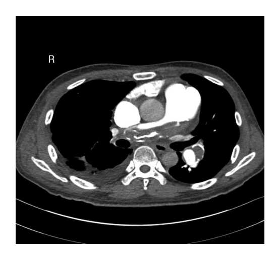
Figure 4. Chest computed tomography showed diffused thrombus in the central and both main pulmonary arteries.

heart sound (S<sub>2</sub>), accentuation of the sound of pulmonic closure (P<sub>2</sub>), and a palpable right ventricular heave. Subsequent findings correspond to decreasing right ventricular function, jugular venous distention, fixed splitting of S,, a right-sided third heart sound (S<sub>3</sub>), tricuspid regurgitation, hepatomegaly, ascites, and peripheral edema [4]. TTE can provide the first clue of CTEPH. It can confirm elevated pulmonary pressures and show right-heart chamber enlargement, abnormal right ventricular systolic function, paradoxical interventricular septal motion, and the impact of an enlarged right ventricle on left ventricular filling [6]. In rare cases, TTE may directly show proximal pulmonary artery thrombus, as in our case [7]. CTEPH is usually diagnosed on the basis of radiological investigations. Ventilation-perfusion lung scanning may be used to differentiate CTEPH from other causes of pulmonary hypertension [8]. Chest CT is used widely for diagnosis of CTEPH. It can identify eccentric thromboembolic material