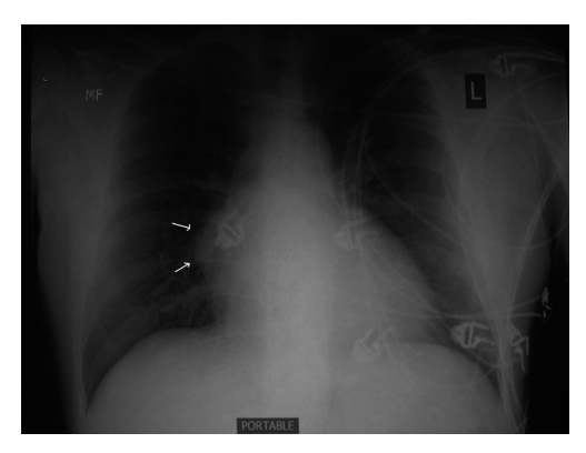
Figure 1. Chest radiograph (postero-anterior view) with calcification in the right heart border (arrows).

Germ cell tumors are thought to originate from primordial germ cells that fail to complete migration from the urogenital ridge and come to rest in the mediastinum. They are classified into teratomas, teratocarcinomas, seminomas, embryonal cell carcinomas, choriocarcinomas, and endodermal cell (yolk sac) tumors [1].